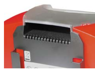
Non slip rear manual grip