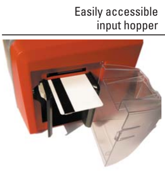
Easily accessible input hopper