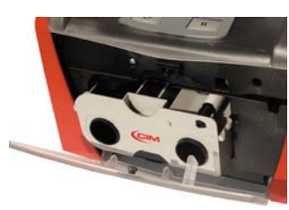
Ribbon cartridge EasyLoad

Simple upgrade options: the Sunlight K3 can be upgraded to meet you future needs as your business requirements or applications change. As many as 56 different configurations are available !